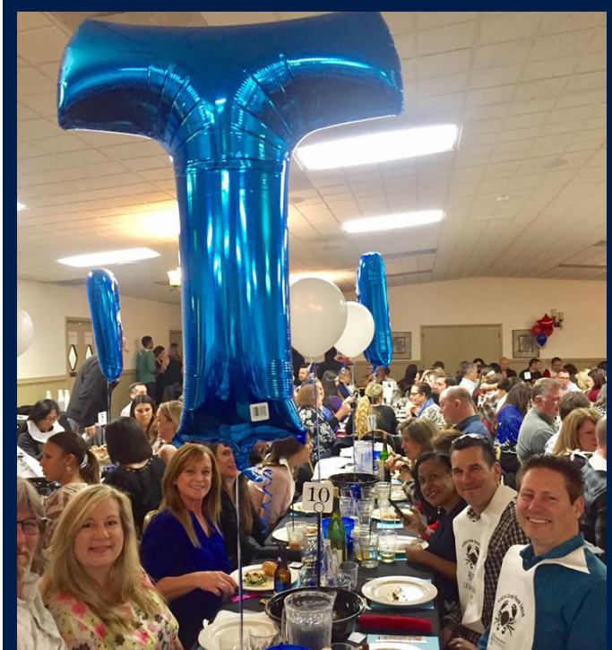
SRTK sponsored VICA's annual Crab Feed in Sacramento this past February, which was a huge success!